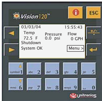
HR-Series PLC Display